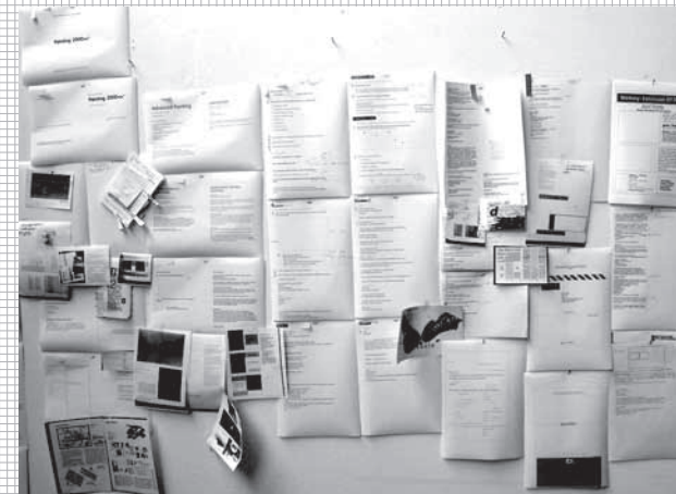
TOP LEFT Work in Progress: typed notes being organised for A Humid Day TOP Work in Progress: Pharmacy Store Section of A Humid Day ABOVE Work in Progress: Study Section of A Humid Day